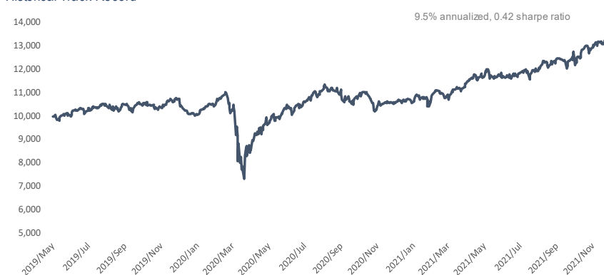
Growth of 10,000

DISCLAIMER: Past performance is not indicative of future results. Performance is net of all estimated trading fees and performance fees. Investing involves varying degrees of risk and there can be no assurance that the future performance of any investment strategy will be profitable. This does not constitute investment advice.